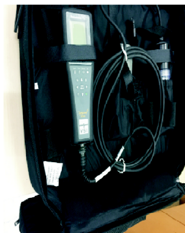
Fig. 1. YSI ProQuatro multi parameter for measuring temperature, dissolved oxygen, salinity, and pH.

In the Marmara University laboratory, the polyethylene bottles were kept in a mixture of 40% nitric acid and 60% deionized water for 24 h and rinsed 3 times with deionized water (ELGA purelab) and dried in the oven (Binder). The current study was carried out in Armutlu Beach, Yalova for 10 days. 10 sea water samples were collected and water temperature ( ^{\circ}\text{C} ), pH, salinity (ppt), dissolved oxygen ( \text{mg L}^{-1} ) measured by using YSI ProQuatro multi parameter (Fig. 1) every day from 5 August to 14 August 2020. When one polyethylene bottle was filled with sea water, the sample were filtered through a 0.45 \mu\text{m} PTFE filter (Sartorius) with a sterile syringe and added 2% nitric acid (Merck) via micropipette and stored in the refrigerator until analysis began. The heavy metals in the seawater samples were identified using inductively coupled plasma optical emission spectrometry (ICP-