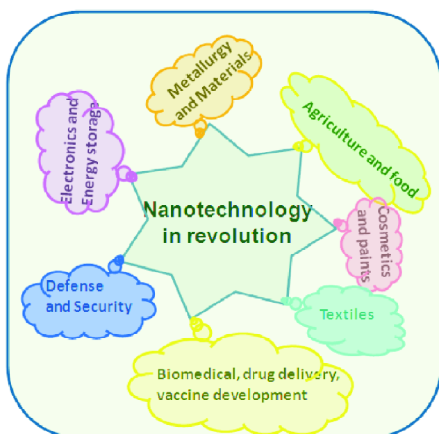
Fig. 1. Technological tsunami due to nanotechnology.

bined drug delivery 60–64 . According to the data by the International Agency for Research on Cancer (IARC), estimates nearly 13.1 million deaths due to cancer by 2030. It is obvious that the low survival rate occurs not because of scarcity of potent, natural, or synthetic antitumor agents but owing to inadequate drug delivery systems. This develops the requirement of technology advancement to need to develop carriers and delivery systems, capable of targeted and efficient delivery of the chemotherapeutic agents without unwanted systemic side effects 65 . The solid lipid nanoparticles and nano-emulsions are the most employed lipid-based drug delivery particles. However, nanosilver based commercial products are capturing market.